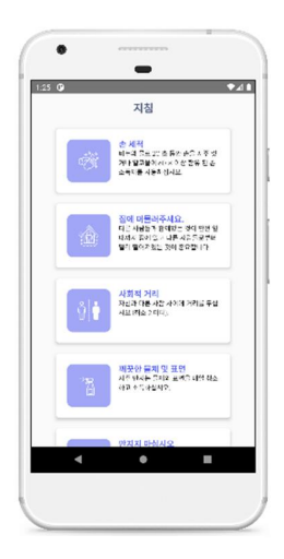
Figure 3. Screenshots of Main Activity in English (left) and Precautions Activity (right) while language was set to Korean

As Figure 3 above, on top of the screen, there are statistics for number of total cases of infected, recovered, active and deceased people. Below them, users can see stats for today. As extra information, we included Systems, Know More and Precautions sections.