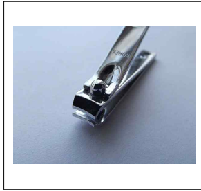
손톱깎이 nail clipper