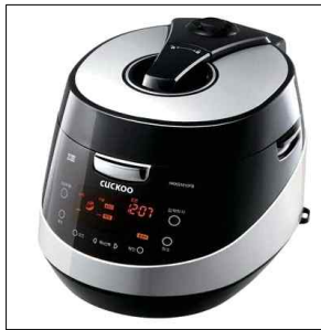
전기밥솥 electric rice cooker