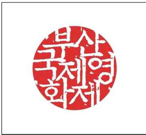
부산국제영화제 the Busan International Film Festival