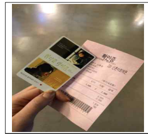
영화표 movie ticket