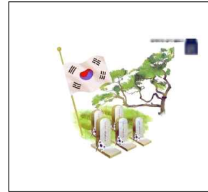
현충일 Hyeonchung-il (Memorial Day)