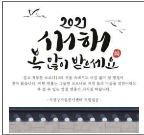
설날 Seolnal (Korean New Year)