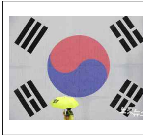
광복절 Gwangbogjeol (National Liberation Day)