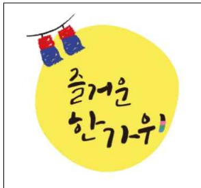
추석 Chuseok (Korea Thanksgiving Day)