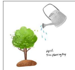
식목일 (Arbor Day)